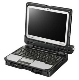
12" fully rugged 2-in-1 (tablet sold separately)